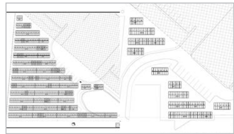
SYSTEM LAYOUT AND ENGINEERING